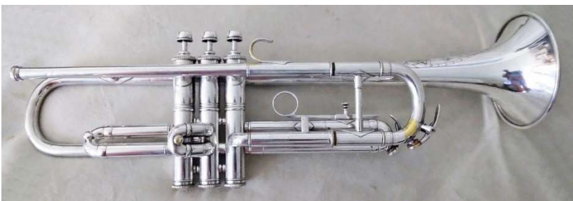
#28325 from 1928.

HANDY ILLUSTRATED CATALOG SENT ON REQUEST