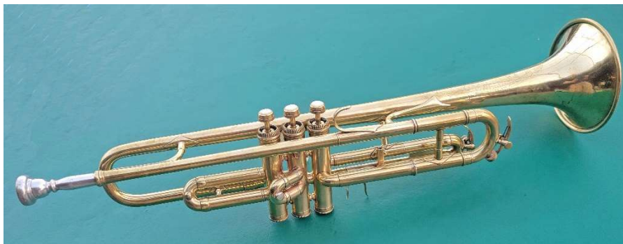
More views of #29156.

Photos are from online sales unless otherwise noted.